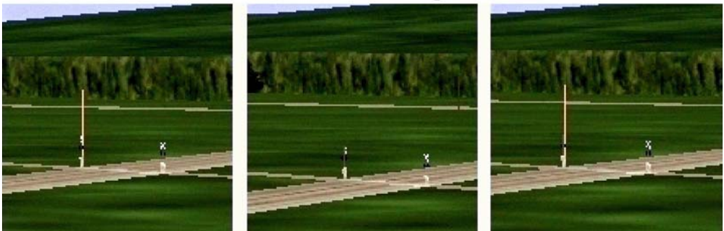
Figure 8: Each column of images above is an identical frame, each row of images represents a certain method of antialiasing. Notice that Quantum3D 4 Subpixel Rotated Grid antialiasing significantly reduces jaggies as well as subpixel flicker. Although antialiasing methods use four subpixels the Rotated Grid selection of subpixels results in significantly improved image quality when compared to the aligned grid method. Enabling this feature on COTS graphics cards requires four times the graphics bandwidth. As a result fill rate performance is dropped to 25% of peak fill rate. Since the jaggies are still very noticeable, crawling, jittering and flickering aliasing remain in the image even with 9 tap Gaussian enable. This is even more noticeable when moving through a 3D model.