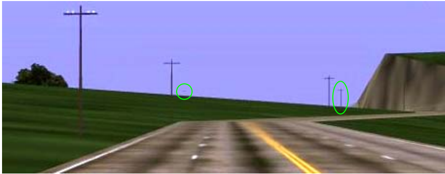
Figure 5: Four subpixel full scene antialiasing. Notice that more of the telephone poles are complete and some in the distance are appearing.