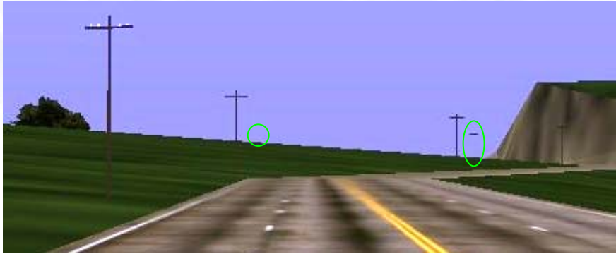
Figure 4: No antialiasing. Notice the jaggies and sub pixel flicker. Some telephone poles or parts of them are not intersecting the center of a pixel and as a result are not displayed. This is typical of any system that does not have antialiasing.