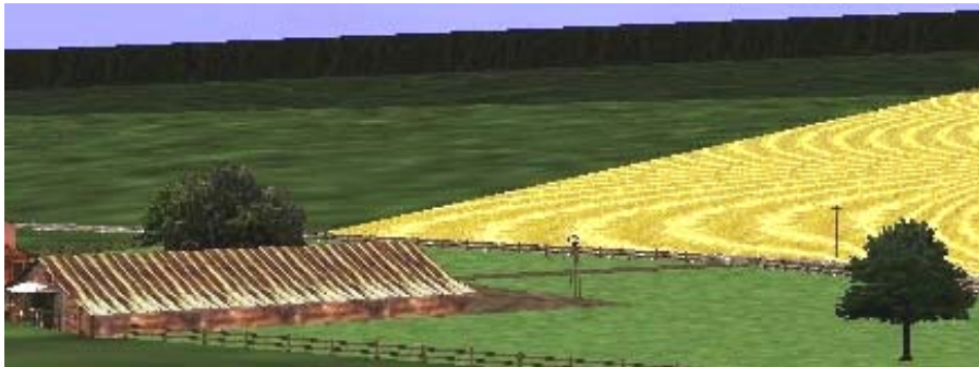
Figure 3: Moiré patterns or high frequency noise