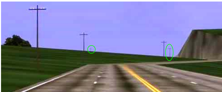
Figure 6: Eight subpixel full scene antialiasing. Notice that all of the telephone poles are complete, even the ones in the far distance.

Reducing aliasing is especially important to simulation applications. Since most of the aliasing is spatial aliasing, simulation users (pilots, gunmen, truck drivers...) end up making assumptions about their environment based on these aliasing artifacts. With aliasing artifacts present on the simulation training display, pilots make