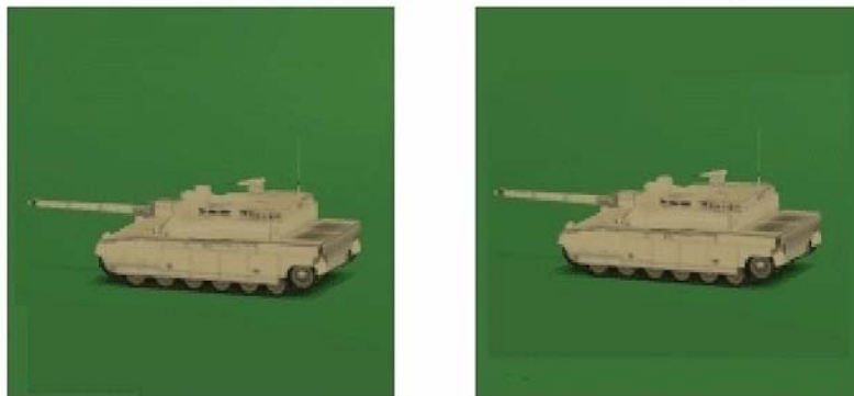
Figure 7: Notice that the antenna on this tank flickers and disappears these distractions prevent users from having a positive and effective immersive experience and could prevent them from recognizing a target. This same effect will happen on various parts of the tank depending on distance; the cannon will disappear and flicker as well.