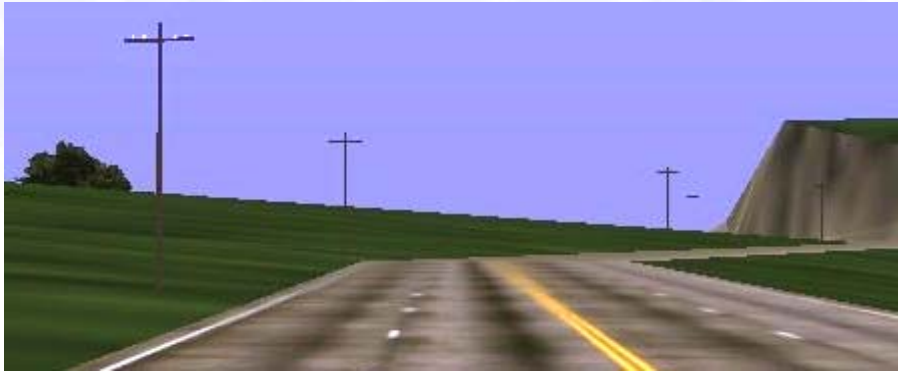
Figure 2: Jaggies and Subpixel flicker. Note that the telephone poles should be complete. When moving through the database, the poles flicker on and off as they cross the center of the sampled pixel. In this picture parts or complete poles are missing.